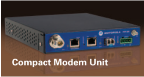
Compact Modem Unit