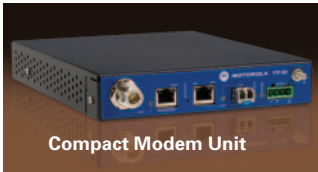
Compact Modem Unit