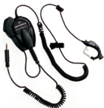
CommPort™ Integrated Microphone/Receiver

It's easy to operate and integrate into any system, and works well with your current XTS and MTS accessories.