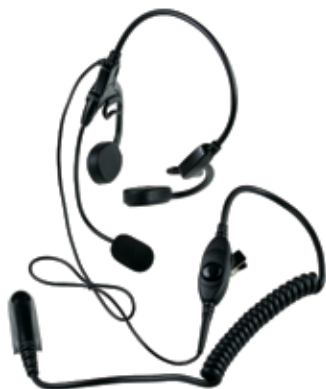
Temple Transducer Headset